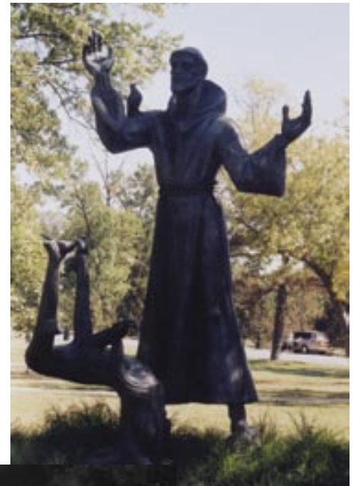
▶ 11. St. Francis of Assisi Statue