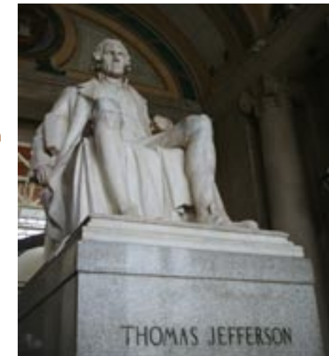
▶ 1. Thomas Jefferson Statue

History: Designed by famed sculptor Karl Bitter and sitting at the heart of the Missouri History Museum, this statue was originally commissioned by the Louisiana Purchase Exposition company as a lasting monument to the nation's third president. Thousands of St. Louis citizens stood within the Jefferson Memorial (Missouri History Museum) loggia and on its lawn in 1913 and watched with delight as a grand parade concluded with the unveiling of Karl Bitter's marble statue of President Thomas Jefferson. On April 30, 1913, the Missouri Historical Society opened its history museum in the 39,000-square-foot Beaux Arts structure.