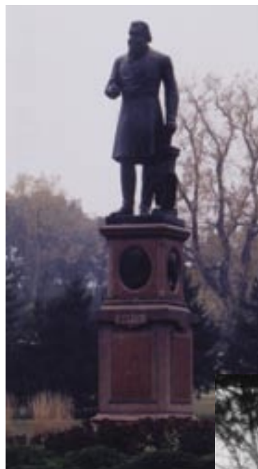
◀ 20. Edward Bates Statue