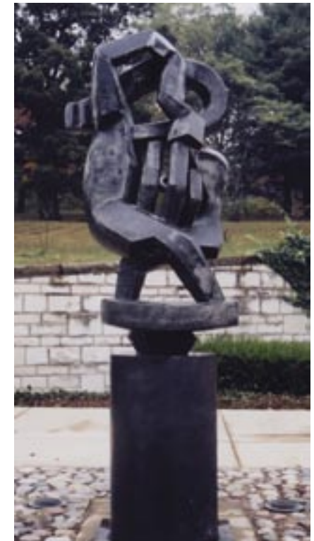
▶ 9. Joie de Vivre

History: Joie de Vivre means "Joy of Life." The original sculpture was done in 1927 at a time when the sculptor was changing from his early Cubist style to a more impressionist, abstract form. The bronze, one of seven casts, suggests a figure in ribbon-like contours. The artist was inspired to create this vibrant work by his sister's serious illness. Jacques Lipschitz is considered to be one of the great modern sculptors.