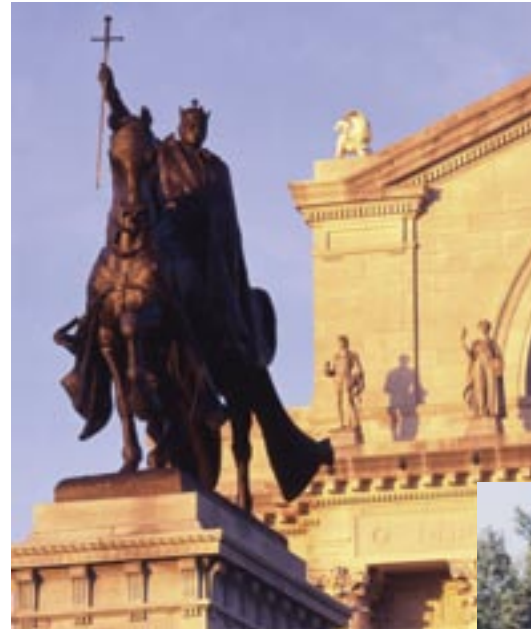
◀ 19. Apotheosis of St. Louis

History: This statue of the Crusader King Louis IX of France was the emblem of the city, appearing on most official documents and the city flag, but now it shares its prominence with the Gateway Arch. The Crusader King Louis IX of France is a symbol of Christianity, the Crusading spirit, and the strength and vitality of the City of St. Louis. The original staff (plaster of Paris with fibers) version of this statue stood at the main entrance gate of the 1904 World's Fair, where the Missouri History Museum is now located. Cast later in bronze, the statue was unveiled in 1906. The Louisiana Purchase Exposition Committee decided to have the sculpture cast and presented to the city as a part of the restoration of Forest Park after the Fair.