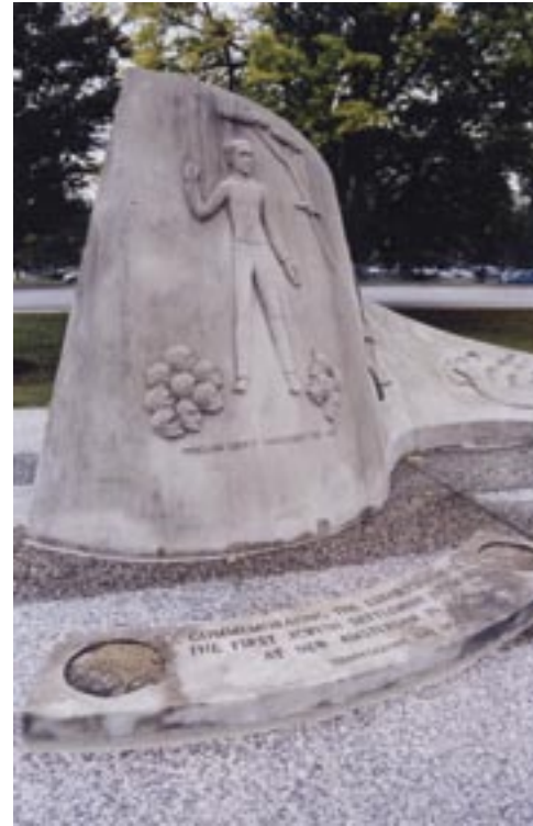
◀ 7. Jewish Tercentenary Memorial

History: The monument was donated by the Jewish Tercentenary Committee in 1956, which was chaired by Rabbi Ferdinand Isserman of Temple Israel. This was to celebrate the 300th anniversary of the founding of the first Jewish settlement in the United States. A large flagpole rests on a stone base, cast in the shape of an ocean wave. The stone features low-reliefs of significant Bible verses and a replica of the ship on which the first Jews came to New Amsterdam in 1654.