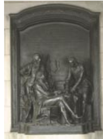
◀ 2. The Signing of the Treaty Tablet

History: The tablet represents Monroe, Livingston, and Marbois signing the Louisiana Purchase Treaty on April 30, 1803. Monroe is on the left, behind the chair; Livingston is seated; and Marbois is signing the treaty. The tablet was donated by the Louisiana Purchase Exposition Company and was unveiled in 1913.