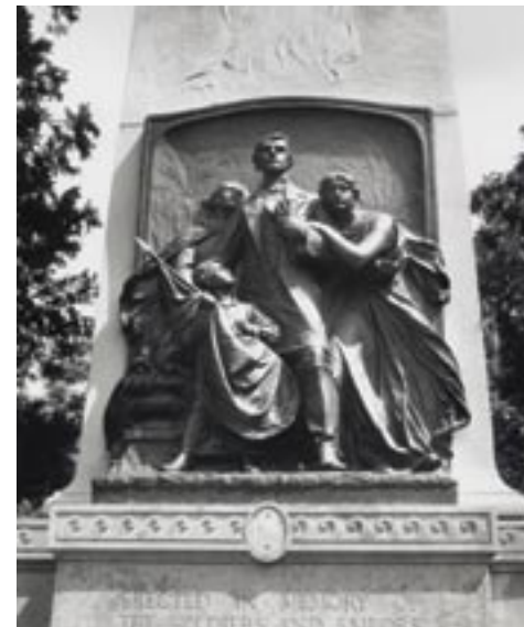
◀ 4. Confederate Memorial

History: At the upper part of the shaft is carved an allegorical figure of the "Angel of the Confederacy." The bronze relief depicts a southern family about to send its only adult male into the war. On the rear is a quote from Robert E. Lee. The memorial was donated by the Ladies Confederate Monument Association, and the statue was dedicated in December 1914.