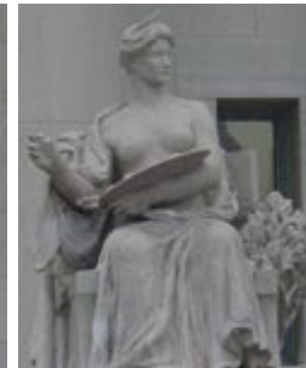
◀ 17. Statues to Sculpture and Painting