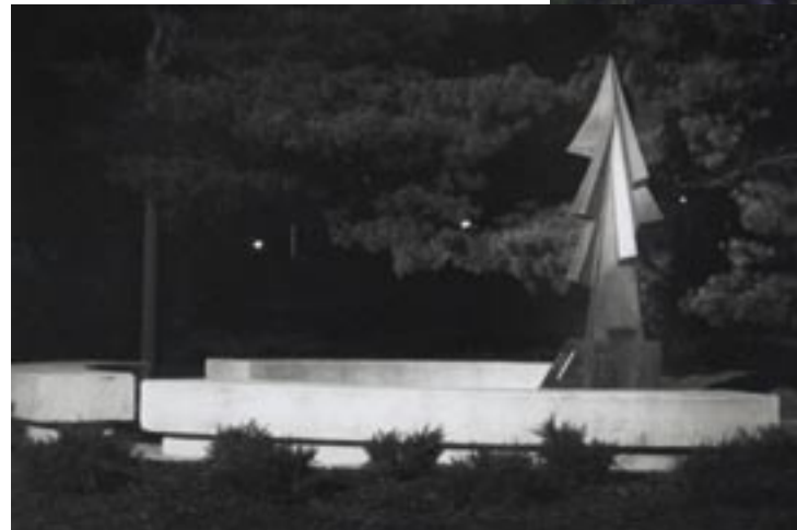
◀ 15. St. Louis Award Pine Tree

History: The St. Louis Award was established in 1931 as an annual award honoring the person making the most outstanding contribution to the St. Louis area. The nine-foot Corten sculpture is a stylized pine tree on a concrete pedestal surrounded by a grove of living trees, planted to honor the recipients of the St. Louis Award.