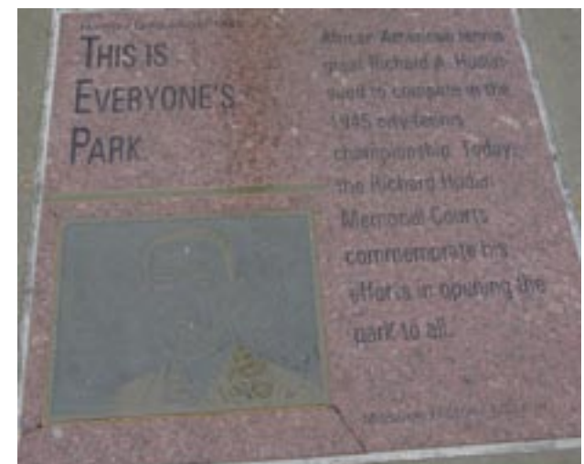
▶ 3. History Underfoot