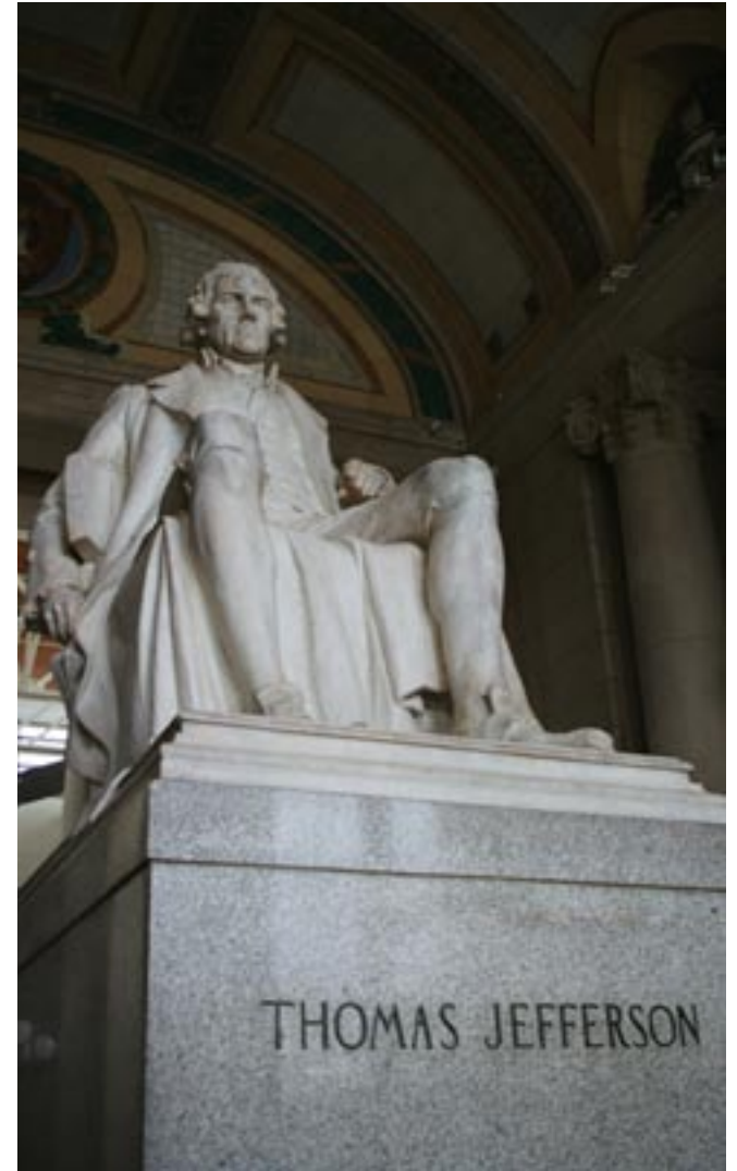
The Thomas Jefferson Statue at the Missouri History Museum

Over the years, Forest Park has become the home of many monuments, statues, and works of art. Each of these artifacts offers an interesting bit of history. Collectively they reflect the rich diversity of St. Louis culture. This self-guided tour highlights those monuments that are located in Forest Park and owned by the City of St. Louis.