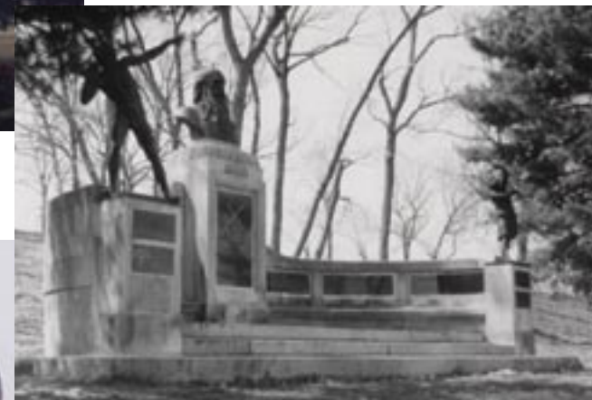
▲ 16. Friedrich Jahn Memorial

History: The monument is placed on the site occupied by the German pavilion during the 1904 World's Fair. It was donated to the city by the North American Gymnastic Union/St. Louis Chapter in 1913. Friedrich Jahn was the founder of the Turnverein, an international gymnastic and fraternal society. He was called the "father of gymnastics" and was often referred to as "Father Jahn" or "Vater Jahn."