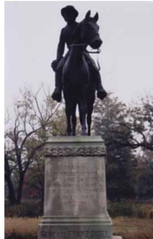
◀ 6. Franz Sigel Statue

History: The experience begins as visitors approach the History Museum's Emerson Center. Starting at the nearby parking areas within the walkways is History Underfoot, an environmental art presentation relating brief stories that unite St. Louisans across time. The 22 History Underfoot panels consist of engraved bronze images of Forest Park from our past, with stories that place the images in historical perspective.