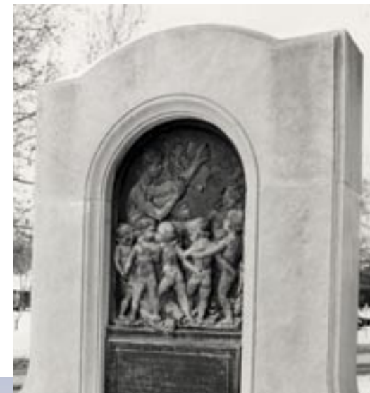
▶ 21. Musicians Memorial & Fountain