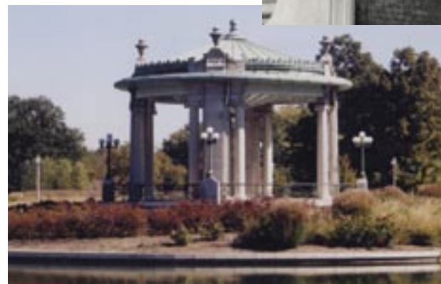
◀ 5. Nathan Frank Bandstand