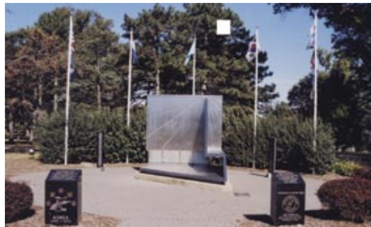
◀ 13. Korean War Memorial

History: In 1951, a floral clock was installed in Forest Park near the Jewel Box as a memorial for those who served during the Korean War. Deterioration and mechanical problems caused that memorial to be decommissioned in 1985. A new memorial, an eight-foot stainless steel sundial, was designed to replace it. The new memorial was surrounded by plantings of Viburnum, ivy, and barberry.