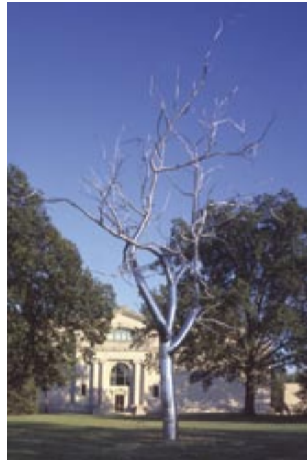
◀ 18. Placebo