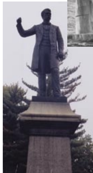
◀ 8. Frank Blair Statue

History: The statue commemorates Blair's work as a United States Senator. As a general, he seized the U.S. Arsenal at St. Louis and kept the city and a large part of Missouri from joining the Confederacy. The statue, in its prominent location, is said to have a place in Winston Churchill's book The Inside of the Cup . The statue was donated by the Blair Monument Association in May 1885.